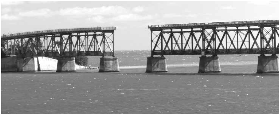
The old Bahia Honda steel trestle was converted to a concrete bridge for cars. Portions of the road were tolled until 1954; toll booths were located on Big Pine Key and Lower Matecumbe.

Of course it started with Henry Flager's ambition to extend his rail network to a deep water port that could serve the newest wonder of the modern world -- the Panama Canal. Henry knew that ships carrying cargo from afar would dock at the nearest rail station to unload untold quantities of goods and treasures destined for the American mainland.